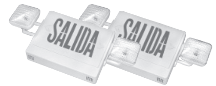
SALIDA faceplates also available.