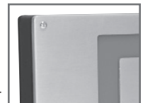
Specify option "TP" for Tamper-Proof face plates