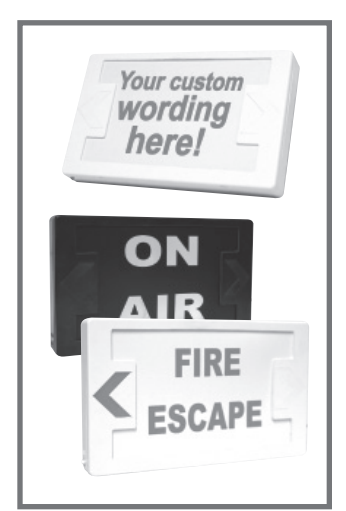
Special Wording Sign samples