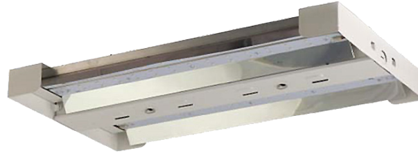
110W & 160W